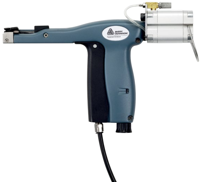
Pneumatic version makes installation faster and easier